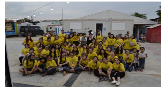
Solidarity Group: Samatasavvata